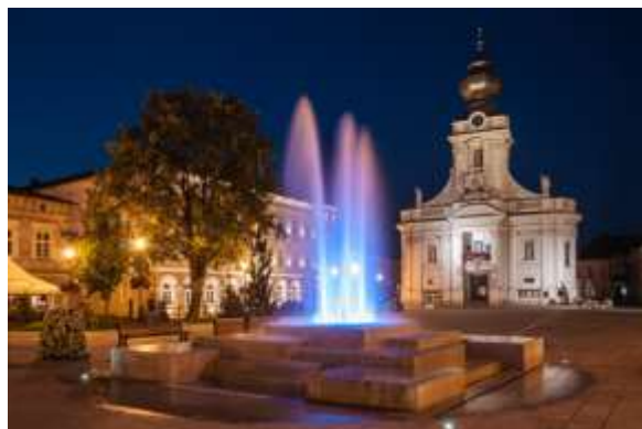
Krakow Poland/ Birthplace of Pope John Paul II