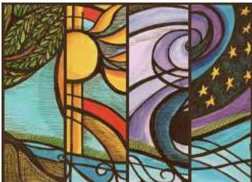
Design based on the "Canticle of the Sun" By Saint Francis of Assisi