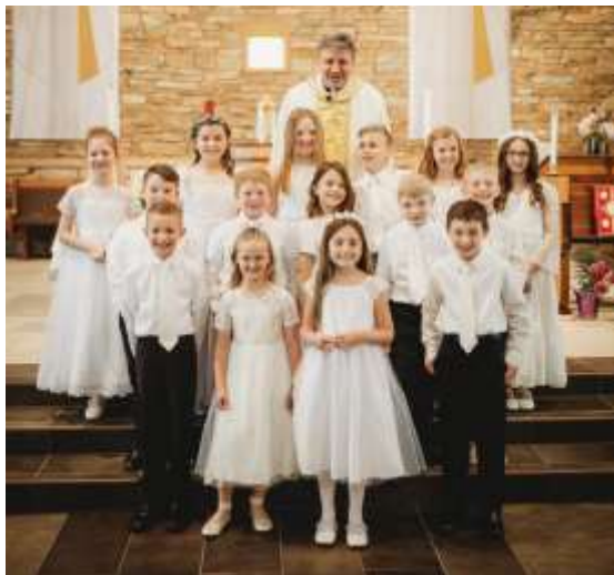
Congratulations to our 2nd Graders.