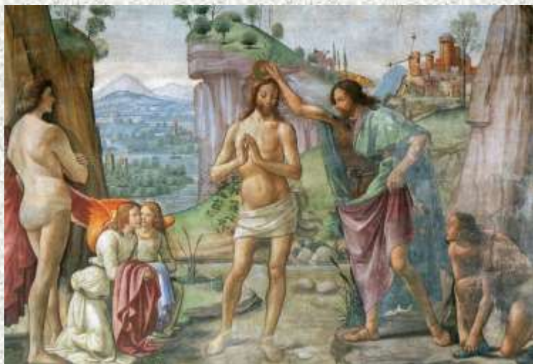
Domenico Ghirlandaio. Baptism of the Lord, fresco, 1486-1490.