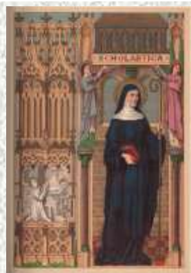
Saint Scholastica 480-543

Patron Saint of Nuns, twin sister to St. Benedict of Nursia. St. Scholastica was dedicated to God from a very young age. She established the first convent of Benedictine Nuns. A fun story recounts that after one of the brother and sister's yearly visits, Scholastica didn't want Benedict to leave, but when she asked him to prolong his stay he refused. Scholastica then closed her hands in prayer, after which a storm broke out, preventing Benedict from returning to his own abbey. She told him "You would not listen, so I asked my God and He did listen".