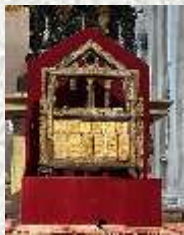
The Chair of St. Peter in 2024 at St. Peter's Basilica, exposed for the first time since 1867

This feast places the Chair or "Cathedra" of Saint Peter at the center of our attention – or rather the specific mission Jesus entrusted to Peter. The feast dates back to the 3rd century and is to be distinguished from the day of Peter's martyrdom celebrated on 29 June. The feast originated around the "cathedra" of Peter, the place where the Bishop of Rome resided and governed. The "cathedra", was a fixed "seat" of the Bishop, placed in the mother church of the Diocese – hence the word "cathedral" – which was the symbol of the Bishop's authority who, as a successor of the Apostles, is called to protect the flock and transmit the teaching of the Gospel to the Christian community. We can say that the first "cathedral" was the Upper Room where Jesus gathered His disciples for the Last Supper and where they, along with the Virgin Mary, received the gift of the Holy Spirit. Later, Peter moved to Antioch, the city evangelized by Barnabas and Paul, where Jesus' disciples were first given the name "Christians" (cf. Acts 11:6). Peter was the first Bishop of Antioch which explains why they celebrated the Feast of the Chair of Peter on 22 February. Later, Peter arrived in Rome where his life ended in martyrdom. Precisely for this "glorious" death, it was decided to consider Rome as the official location of the "Cathedra" of Saint Peter, with a celebration fixed on 18 January. Pope John XXIII united these two feasts, abolishing the latter. (from the Vatican news )