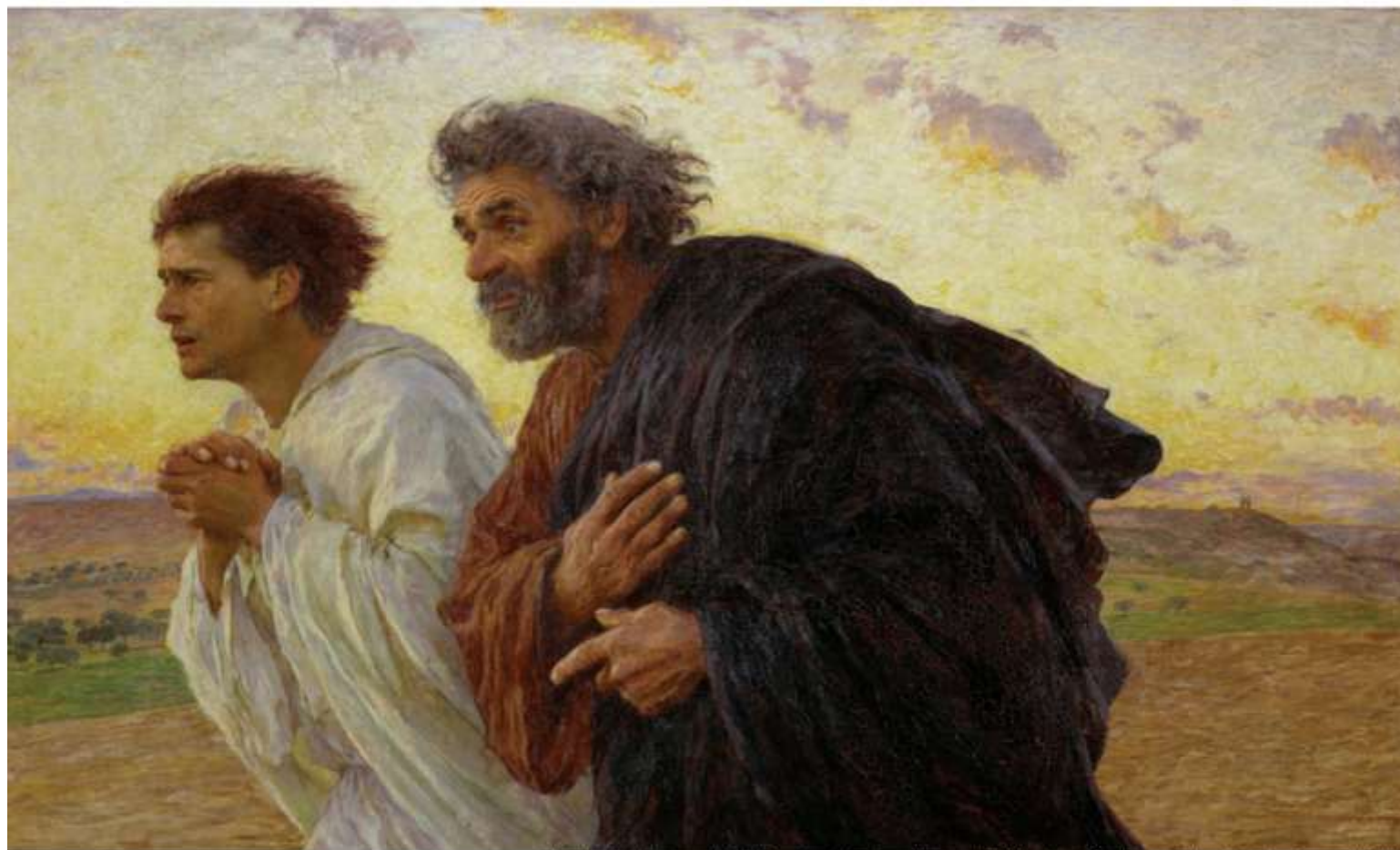
The Disciples Peter and John Running to the Sepulchre on the Morning of the Resurrection, Eugène Burnand, 1898