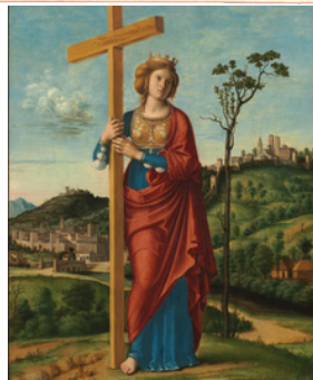
Saint Helena, oil on panel by Giovanni Battista Cima da Conegliano, 1495; in the collection of the National Gallery of Art, Washington, D.C.

As well as celebrating the sacrifice of Jesus on the Cross, the Feast of the Exaltation of the Holy Cross commemorates two historical events. The first is the discovery in 320 AD of the True Cross, of Calvary, and of the tomb of Christ by St. Helena, the mother of Emperor Constantine, which the Romans had buried under a Temple to Venus. The second is the dedication of a church on the site in 335 AD. Today this church, in continuous existence since then, is known as the Basilica of the Holy Sepulcher, and houses the Calvary, the Tomb of Jesus, and the cistern in which St. Helena found the instruments of the Passion, including the Cross.