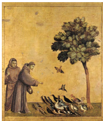
St. Francis Preaching to the Birds Giotto, Circa 1299 The Basilica of St. Francis of Assisi, Assisi Rome

b. 1182– d. 1226 Patron Saint of animals, ecologists, families, lacemakers, merchants, needleworkers, peace, and zoos Invoked against dying alone and fire Canonized by Pope Gregory IX on July 16, 1228 Liturgical Color: White