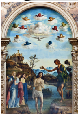
Cima da Conegliano, Baptism of the Lord , oil on canvas, 1492

A simple way to celebrate is to light your baptismal candles during family dinner.